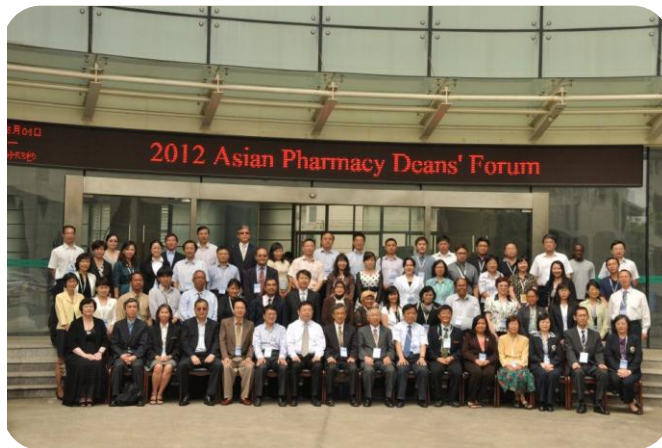
The participants of the 2 nd Pharmacy Deans Forum at the China Pharmaceutical University in Nanjing, China held June 4-6, 2012.